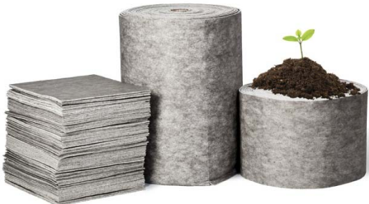
SPC Re-Form™ XPlus Sorbents

Have a SPCC audit coming up soon? Bring BDI and Sorbent products in for a plant survey. Accidents happen. So be prepared, SPC offers a complete selection of spill kits for plants, laboratories, work stations and construction sites.